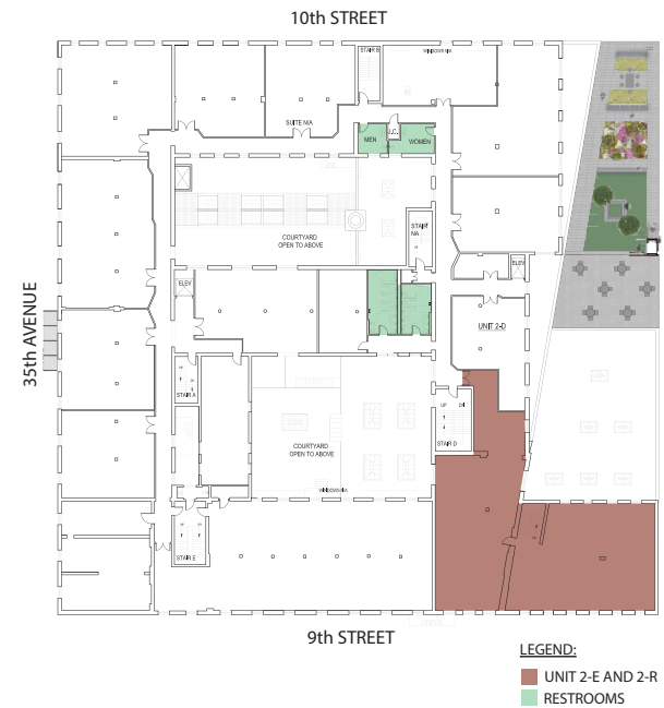
SECOND FLOOR KEY PLAN